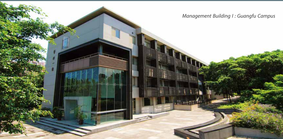
Management Building I : Guangfu Campus

Top 100 MBA for Entrepreneurship in the World by Best-masters.com