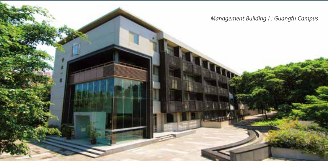
Management Building I : Guangfu Campus

Top 100 MBA for Entrepreneurship in the World by Best-masters.com